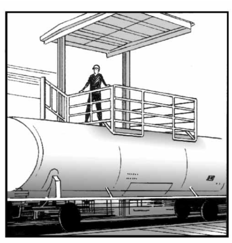
PREVENTION WORK IN GUARDED AREA