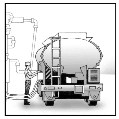
ELIMINATION WORK AT GROUND LEVEL

EFSS is your site-specific fall protection specialist, offering fall protection designs and engineering documentation.